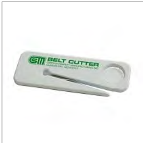
R200-950 (Certified Safety R200-950) SEAT BELT CUTTER