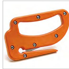
8705 (Sure-Lok® 8705) PREMIUM WEB CUTTER