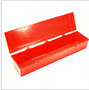
794 (Truck Lite® 794) TRIANGLE FLARE REPLACEMENT BOX