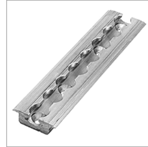
Q5-6008-F (Q Straint® Q5-6008-F) FLANGE TRACK 8" LONG