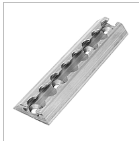
Q5-6100-SR (Q Straint® Q5-6100-SR) SURFACE RAIL TRACK 100" LONG