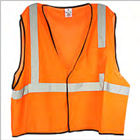
10026739 VEST,SAFETY,US,CLASS 2,7X/8X,ORANGE