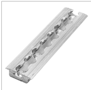
Q5-6100-FPD 100 FLANGED & PREDRILLED L TRACK