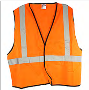
10026772 VEST,SAFETY,CANADIAN,CLASS 2,4X/5X,ORANGE