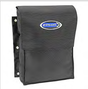
Q5-8522 (Q Straint® Q5-8522) STORAGE WALL POUCH