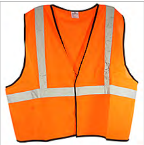
10026773 VEST,SAFETY,CANADIAN,CLASS 2,7X/8X,ORANGE