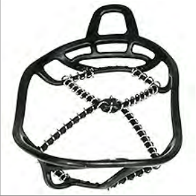
10027705 CLEAT,TRACTION,WINTER TRAX,SIZE 6-12,10850