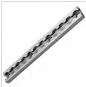
Q5-6012 (Q Straint® Q5-6012) REGULAR TRACK 12" LONG