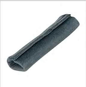
Q5-6409 (Q Straint® Q5-6409) NECK PROTECTOR