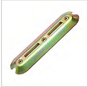
MA-7560 (Q Straint® MA-7560) A-TRACK PLATE (HARDWARE PURCHASED SEPARATELY)