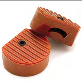
8726 (Sure-Lok® 8726) OVERSIZED RELEASE BUTTON FOR RETRACTOR, SET OF 2 PER BAG