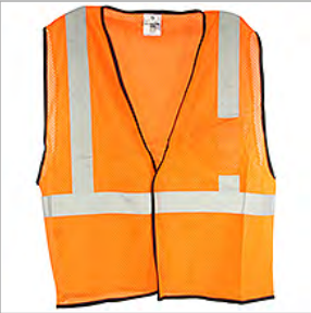
10026737 VEST,SAFETY,US,CLASS 2,2X/3X,ORANGE