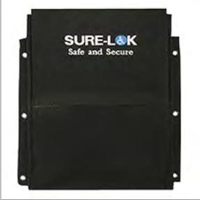
FE201145 HEAVY DUTY STORAGE CONTAINER