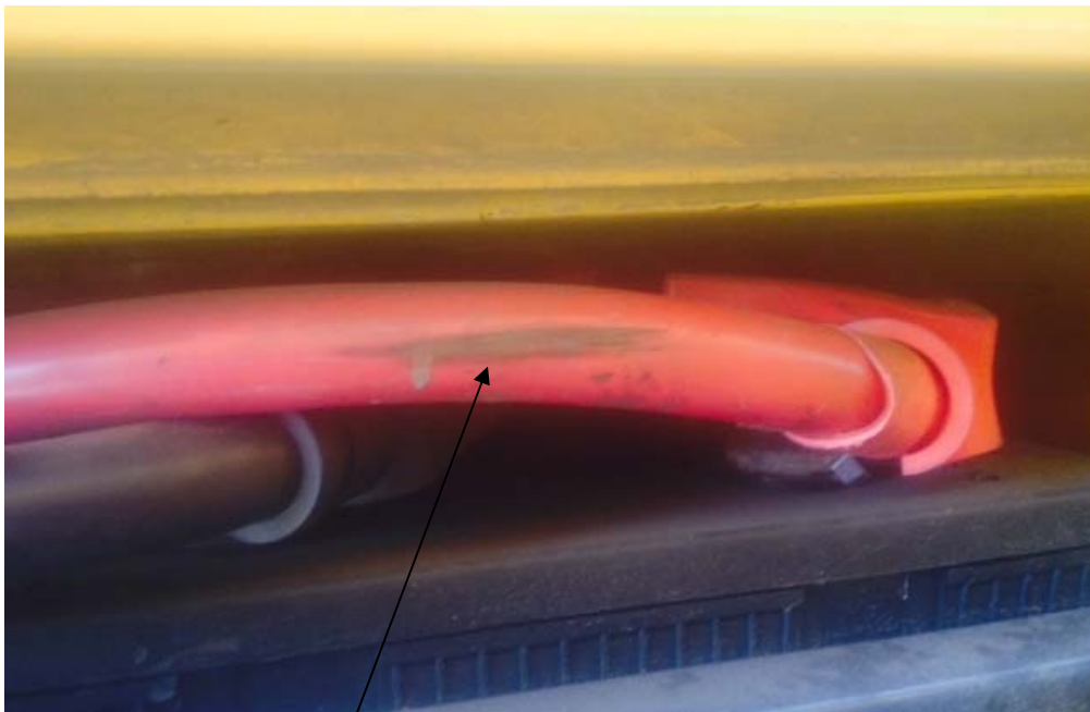
Indicates positive cable is contacting compartment door reinforcement