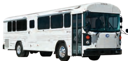
Commercial Rear Engine Bus