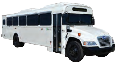
Commercial Vision Bus