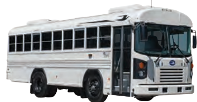
Commercial Front Engine Bus