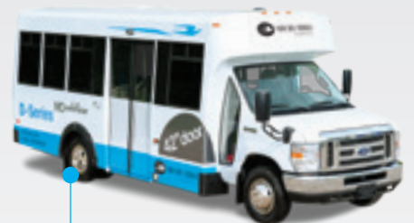
D-Series MD Edition 42" entrance door