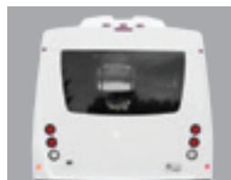
Extra wide rear view window