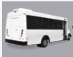
Dark tint panoramic windows