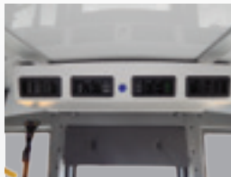
Up to 82K BTU A/C