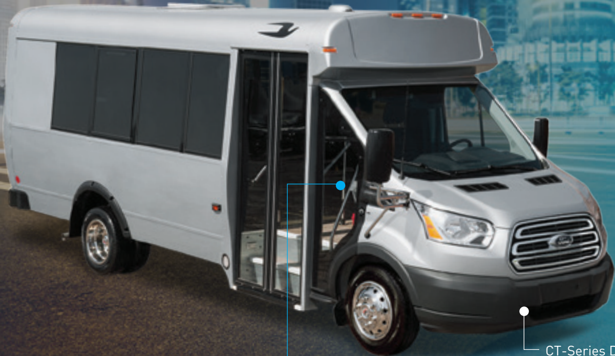
CT-Series DLX DIESEL