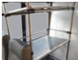
Rear luggage rack